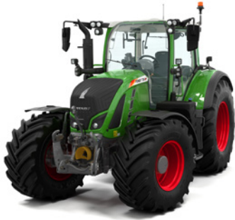
AGCO Fendt GmbH / Aixsponza

“Fast renders bring back the joy of creativity, which induces artists to tweak shots until they are truly happy with the results.”