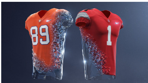
Nike USA Inc. | NABD / Aixsponza