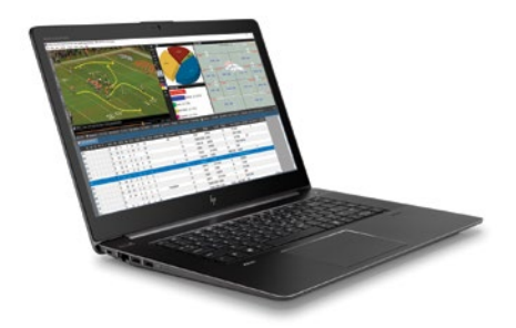
HP ZBook Studio running DVSport GameDay

ultra-powerful desktop and mobile devices endowed with the latest NVIDIA® Quadro® graphics cards, and super-crisp HP Z Displays. "HP now is present across the entire Denver Broncos organization," Trainor says. "From the smaller HP Elite x2 PC Tablets all the way to HP Z Workstations, we believe it's the best platform on the market."